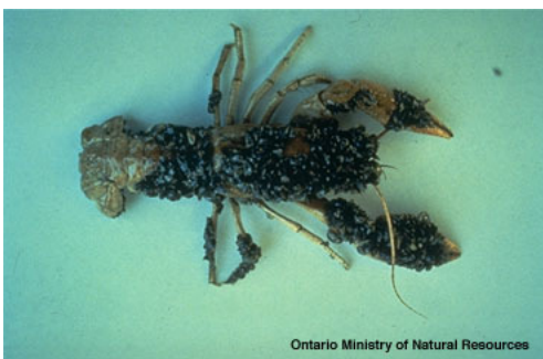
Crayfish covered with zebra mussels.

Sierrans should educate themselves on the scope of the project, the timetable of the project, and the potential ecological impacts (and possible mitigations of the ecological impacts) of the project, since the project is proceeding rapidly. There has never been such a high-volume, high-speed long-distance corridor for bulk transport of varied materials across Earth's surface, and this will potentially allow unprecedented opportunities for species introduction. from Mexico and Asia — most likely small species such as insects, plant species with traveling and/or hitchhiking seeds, and microscopic biota.